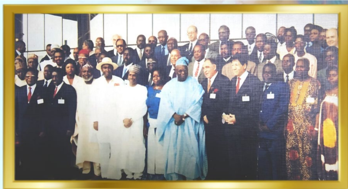
The President Of The Federal Republic Of Nigeria, Chief Olusegun Obasanjo, Gcfr Having A Group Photograph With The Delegates At The African Ministers Council On Water (amcow) Meeting April 29-1st May, 2002

promote cooperation, security, social, economic development and poverty eradication – through effective water resources management and utilisation.